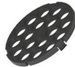
Outer light shield Honeycomb anti-glare net Deep cylinder anti-glare shield